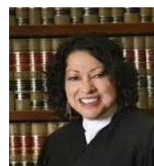
Sonia Sotomayor 1 st Latina Supreme Court Justice in US history