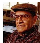
Jamie Escalante One of the most famous educators in American history