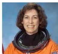
Dr. Ellen Ochoa 1 st Hispanic woman to leave Earth's atmosphere