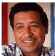
Cesar Chavez United Farm Workers Founder